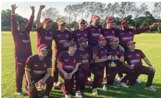
1 st Team – Cheshire Cricket league cup

Thanks to all supports, sponsors, parents, and players for getting involved and supporting the club throughout the season. In particular thanks to our main sponsors The Dog.