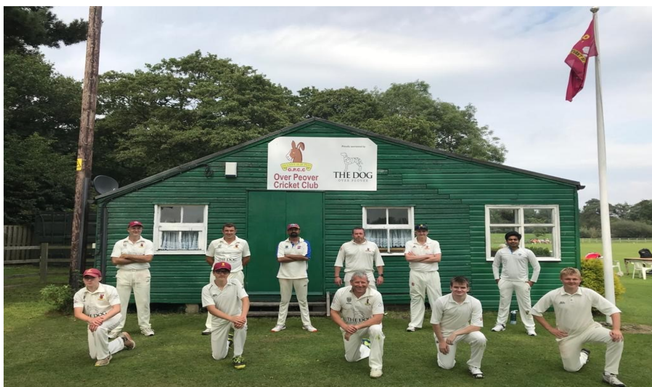
A socially distanced second XI

Thanks to all who have supported the club in a challenging year, for more information please go to www.overpeovercc.co.uk