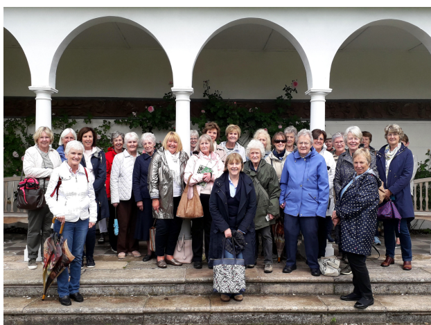
The Over Peover ladies manage to dodge the showers and enjoy the magnificent rose displays.

With heads still spinning from the vast choice, the ladies pondered which roses to purchase over a delicious cream tea. Decisions made, roses were carefully packed and stored away in the coach before the journey home. The weather may have been grey, but it was far outweighed by memories of an afternoon spent amongst the 'stars' of the garden.